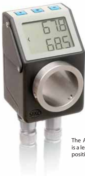
The AP04 indicator from SIKO is a leading absolute, electronic position indicator.

It's quicker than ever; downtime drops as quickly as profit climbs. When changeover time is reduced to almost nothing, it won't take long for the new system to pay for itself.